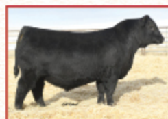
DEEP CREEK LEGITIMATE 203 SIRE