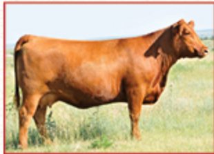
C-BAR ABIGRACE 122J DAM

SELLING 1/2 INTEREST AND FULL POSSESSION.