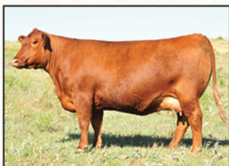
C-BAR STONY 837F