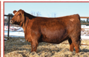
LIPTON PVF ABIGRACE 372N MATERNAL SIB