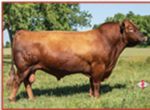
BIEBER CL STOCKMARKET E119 SIRE

SELLING 1/2 INTEREST AND FULL POSSESSION.