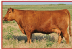
C-BAR STONY 907G DAM

LIPTON PVF STONY 360N is a beautifully made daughter of the $400,000 PIE Hollywood 222 and the influential C-Bar Stony 907G. She offers a balanced, feminine look with depth of body and natural shape—hallmarks of the Stony cow family. Her maternal strength is well proven, as she is a maternal sibling to the widely used Genex AI sire C-Bar Collateral 203J. The consistency of this cow family is further evidenced by 907G's ability to produce elite bulls, including our high-selling LIPTON PVF Quarterback 275M in the 2025 NY Right on Red Sale, going to Explosive Cattle Company of Arkansas. 360N represents another opportunity to access the maternal power and proven look the Stony lineage is known for.