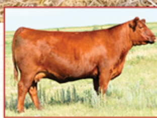
C-BAR STONY 6H DAM