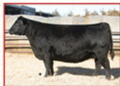
LHR SUSIE 8809 DAM

If you're looking to add performance and carcass merit from a fresh pedigree, 984N deserves a serious look.