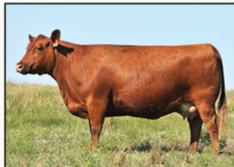
C-BAR ABIGRACE 636D