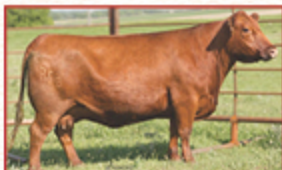
BIEBER PRIMROSE 107W DAM

LIPTON PVF PRIMROSE 376N is a smooth-made, eye-catching female with added length of body, a great spring of rib, and a balanced, functional design that stands out on the move. She combines femininity with substance and carries herself with the kind of presence expected of a high-end donor prospect. She is out of the iconic Bieber Primrose 107W and sired by one of the hottest bulls in the Angus breed, Connealy Craftsman. Her maternal strength is proven, with high-achieving siblings including the $33,000 ABS sire WSM Playmaker 1080J and the $25,000 Feddes FCC Solid State 3602. On paper, 376N ranks top 3% ProS with nine traits in the top 15% and posted an impressive 126 IMF ratio