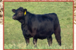
318N CALFHOOD PHOTO

Lot 36B REG # 5074995 DOB 01-06-2025 ID 318N CAT 2