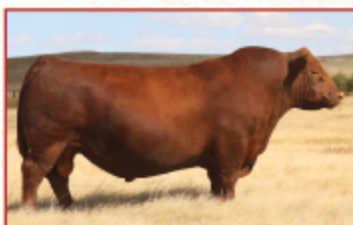
KJL CLZB COMPLETE 7000E MATERNAL SIB