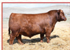
RED U2Q BOSS HOG 2161K SIRE

This is a well-balanced herd bull prospect with proven maternal backing.