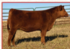
LIPTON PVF FAYETTE 240M MATERNAL SIB