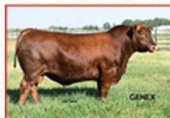
C-BAR COLLATERAL MATERNAL SIB