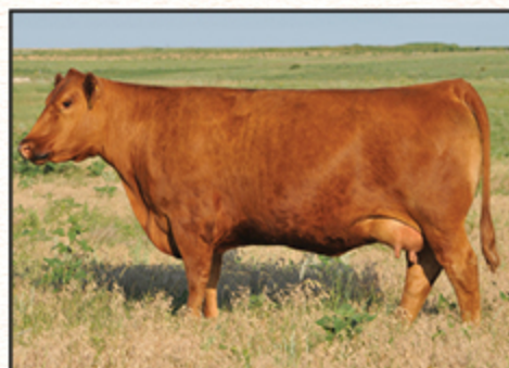
C-BAR STONY 907G