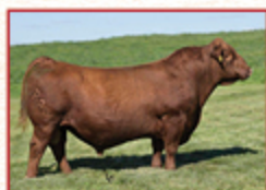
BIEBER HARD DRIVE Y120 SIRE