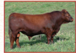
HRP COMPLETE 4124M SERVICE SIRE OF LOTS 47 & 48