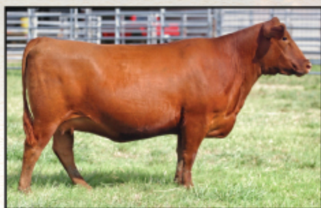
JEFFRIES MS. LADY G26