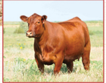
C-BAR STONY 6H DAM