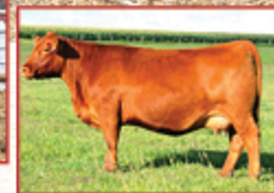
BERWALD STONY 0001 MATERNAL SIB