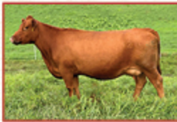
PIE FAYETTE 1215 DAM

At the buyers convenience, we are retaining the option to a flush with a minimum of (6) viable embryos to the bull of our choice.