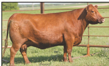
BIEBER PRIMROSE 107W