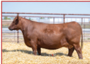
HXC 507 DAM