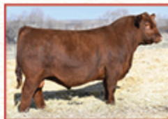
RED U2 TOWNSHIP MATERNAL SIB