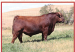
WHEEL STARK 67G SIRE

Lot 25 REG # 5124337 DOB 01-16-2025 ID 5008 CAT A