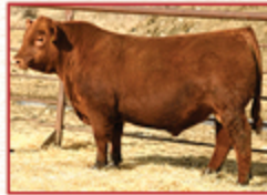
BERWALD PVF OUTRIGHT 221L SERVICE SIRE OF LOT 47

AI bred to the $85,000 Berwald Outright 221L Due September 9, 2026 These heifers were selected from our commercial replacement group and AI bred to the late Outright 221L. All are confirmed safe to the AI date, providing a tight and predictable calving window.