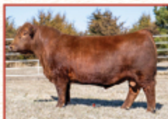
PIE HOLLYWOOD 222 SIRE