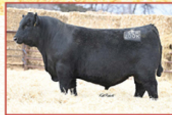
SPRING COVE GRANT 200K SIRE