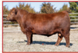
PIE HOLLYWOOD 222 SIRE