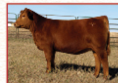
LIPTON PVF STONY 280M MATERNAL SIB