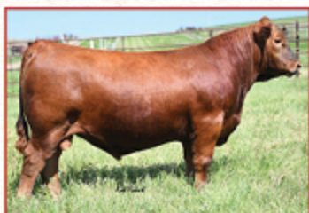
BERWALD CONFIDENT SIRE OF LOT 24