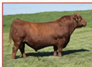
BIEBER HARD DRIVE Y120 SIRE