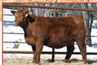
LIPTON PVF STONY 321N FULL SIB