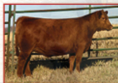
LIPTON PVF FAYETTE 238M MATERNAL SIB