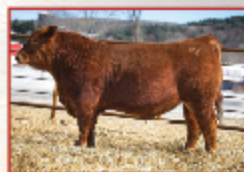
LIPTON PVF QUARTERBACK 275M MATERNAL SIB

At the buyers convenience, we are retaining the option to a flush with a minimum of (6) viable embryos to the bull of our choice.