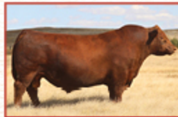
KJL-CLZB COMPLETE 7000E SIRE