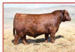
U2Q BOSS HOG 2161K SIRE