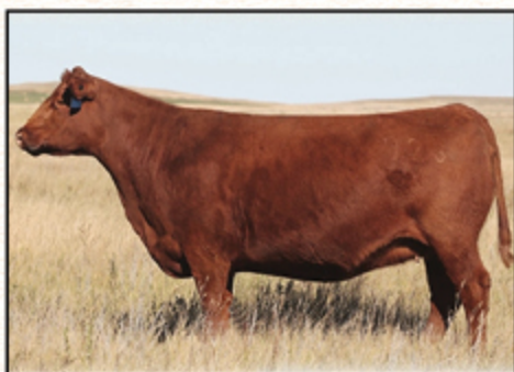
TKP TILLY 928