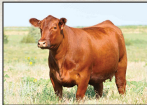
C-BAR STONY 6H