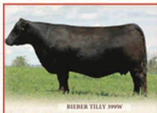
BIEBER TILLY 399W MATERNAL GRANDDAM

A favorite from early on, 329N has continued to impress. He commands attention the moment you step into the pen – powerful, balanced, and built with presence, reminding us a great deal of his sire, Outright 221L.