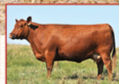
C-BAR ABIGRACE 636D MATERNAL GRANDDAM