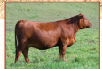
LIPTON STONY 236L MATERNAL SIB