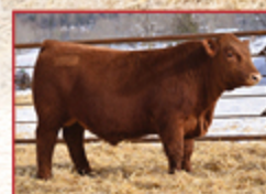
LIPTON PVF EASTBOUND 361N FULL SIB

Proven maternal backing paired with elite carcass strength – 364N deserves serious consideration.