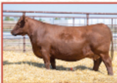
HXC 207C DAM

At the buyers convenience, we are retaining the option to a flush with a minimum of (6) viable embryos to the bull of our choice.