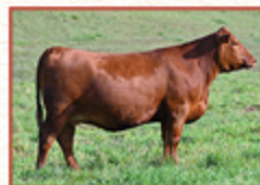
LIPTON STONY 236L MATERNAL SIB