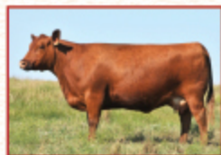
C-BAR ABIGRACE 636D MATERNAL GRANDDAM