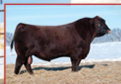
RED COCKBURN RIBEYE 308U SIRE