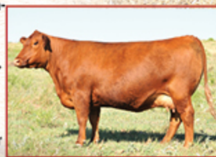
C-BAR STONY 837F DAM