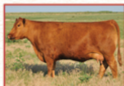
C-BAR STONY 907G DAM