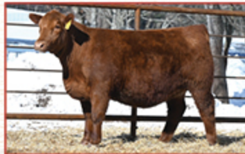
LIPTON PVF STONY 321N MATERNAL SIB

Genomically, he stands among the top of the breed, ranking top 4% ProS, top 2% WW, top 4% YW, and top 1% REA. Physically, he matches the data – stout, smooth-made, long-bodied, and carrying a hindquarter packed with muscle.