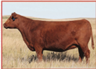
TKP TILLY 928 DAM