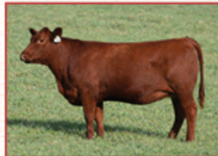
KRA PVF TILLY 4022 MATERNAL SIB