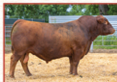
C-BAR CRACKERJACK MATERNAL SIB