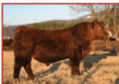
LIPTON PVF AFTERSHOCK 325N FULL BROTHER