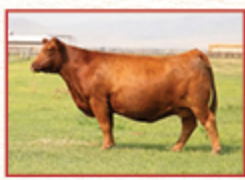
DAMAR BONNIE D249 DAM