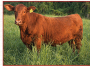
LIPTON BONNE BEL 217L DAM

ADJ BW ADJ WW ADJ YW 77 663 1175 ET ET ET