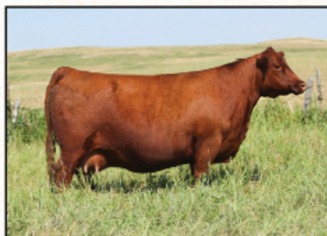
U2 BEAUTY 113Z