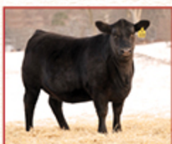
LIPTON PVF BONNE BEL 320N MATERNAL SIB