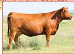
C-BAR ABIGRACE 122J DAM

Weights ADJ BW ADJ WW ADJ YW 83 869 1182 RATIO ET ET ET