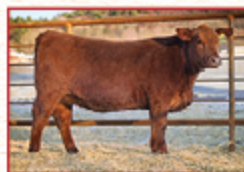
LIPTON PVF FAYETTE 262M MATERNAL SIB