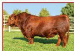
PIE QUARTERBACK 789 SIRE