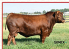
C-BAR COLLATERAL MATERNAL SIB