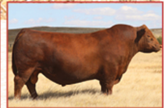
KJL/CLZB COMPLETE 7000E SIRE