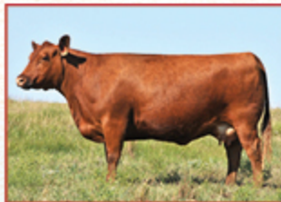
C-BAR ABIGRACE 636D MATERNAL GRANDDAM