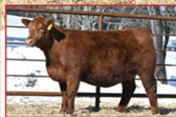
LIPTON PVF STONY 321N FULL SIB