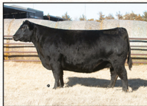
LHR SUSIE 8809