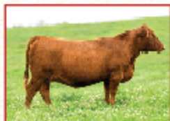
LIPTON BONNE BEL 219L DAM