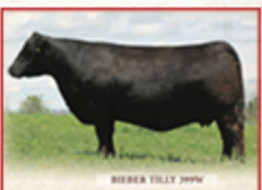
BIEBER TILLY 399W MATERNAL GRANDDAM