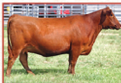
JEFFRIES MS. LADY G26 DAM

At the buyers convenience, we are retaining the option to a flush with a minimum of (6) viable embryos to the bull of our choice.