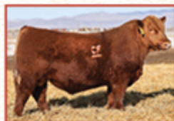
FEDDES FCC SOLID STATE 3602 MATERNAL SIB