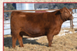
LIPTON PVF STONY 369N MATERNAL SIB

Stacking the proven Stony cow family with the Abigrace influence, 180N brings together two powerful maternal lines in one complete package.