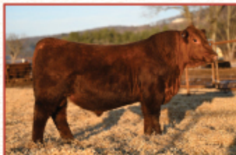
PVF AFTERSHOCK 325N MATERNAL SIB