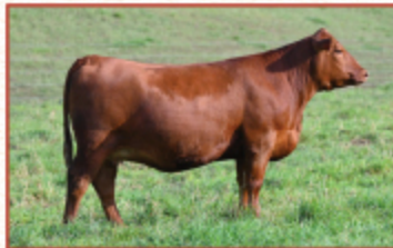
LIPTON STONY 236L MATERNAL SIB

939N combines some of the most influential genetics in both the Red Angus and Black Angus breeds into one powerful package. Sired by the $400,000 Spring Cove Grant 200K, he brings elite performance and carcass potential into this offering.