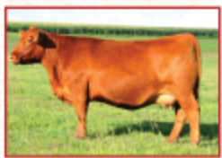
BERWALD STONY 0001 MATERNAL SIB