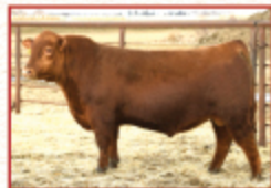
BERWALD PVF OMAHA 213K MATERNAL SIB