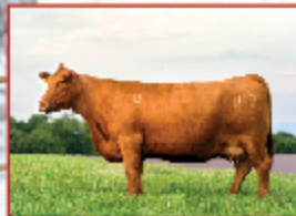
BERWALD ABIGRACE 1110J DAM