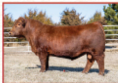
PIE HOLLYWOOD 222 SIRE