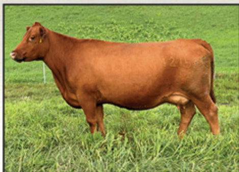
PIE FAYETTE 1215