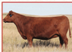
TKP TILLY 928 DAM