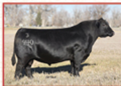
CONNEALY CONFIDENCE PLUS SIRE OF LOTS 36 A/B