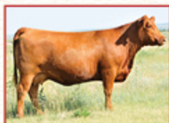
C-BAR ABIGRACE 122J DAM