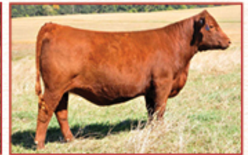
BERWALD BONNE BEL 1165J MATERNAL GRANDDAM