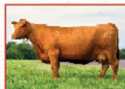
BERWALD ABIGRACE 1110J DAM