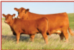
C-BAR STONY A302 DAM

At the buyers convenience, we are retaining the option to a flush with a minimum of (6) viable embryos to the bull of our choice.