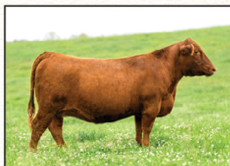
LIPTON BONNE BEL 219L