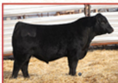
KIRWAN BREAK AWAY MATERNAL SIB