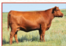
C-BAR ABIGRACE 121J DAM

At the buyers convenience, we are retaining the option to a flush with a minimum of (6) viable embryos to the bull of our choice.