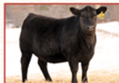
LIPTON PVF BONNE BEL 320N FULL SIB