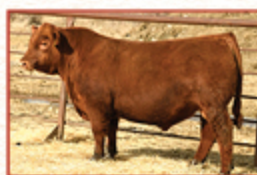
BERWALD PVF OUTRIGHT 221 SIRE