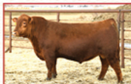
BERWALD PVF OMAHA 213K MATERNAL SIB

Lot 23 REG # 5156951 DOB 01-23-2025 ID 984N CAT 2