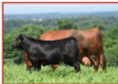
327N CALFHOOD PHOTO