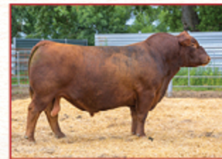
C-BAR CRACKERJACK MATERNAL SIB