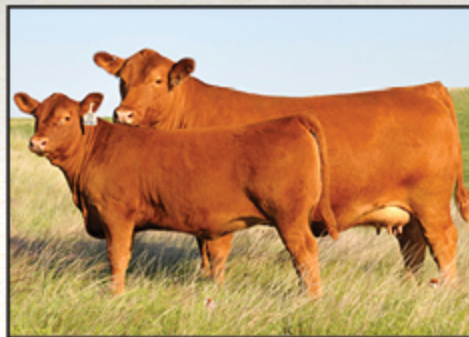
C-BAR STONY A302