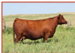
U2 BEAUTY 113Z DAM