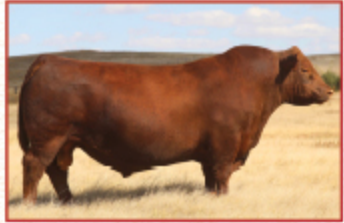
KJL/CLZB COMPLETE 7000E MATERNAL SIB

We knew his name the day he hit the ground. On January 27, 2025, a 3.8 magnitude earthquake struck the northeast – the strongest in over a decade. Many felt the ground shake. Some names choose themselves!