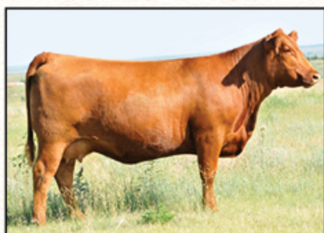
C-BAR ABIGRACE 122J