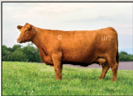
BERWALD ABIGRACE 1110J