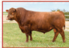
PIE INTENSITY 295 SIRE