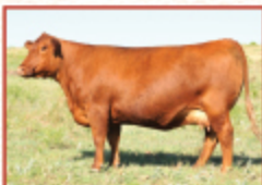
C-BAR STONY 837F DAM

At the buyers convenience, we are retaining the option to a flush with a minimum of (6) viable embryos to the bull of our choice.