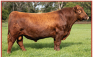
BIEBER JUMPSTART J137 SIRE

537N is a standout Jumpstart son out of Christy's Doarv 33L, a cow boasting an impressive 107 MPPA. His maternal lineage is known for sound foot and leg structure paired with powerful maternal traits.