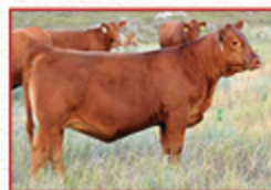
C-BAR STONY 312L MATERNAL SIB