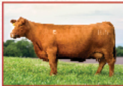
BERWALD ABIGRACE 1110J DAM

At the buyers convenience, we are retaining the option to a flush with a minimum of (6) viable embryos to the bull of our choice.