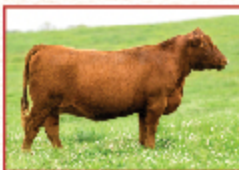
LIPTON BONNE BEL 219 L DAM OF LOTS 36 A/B

At the buyers convenience, we are retaining the option to a flush with a minimum of (6) viable embryos to the bull of our choice.