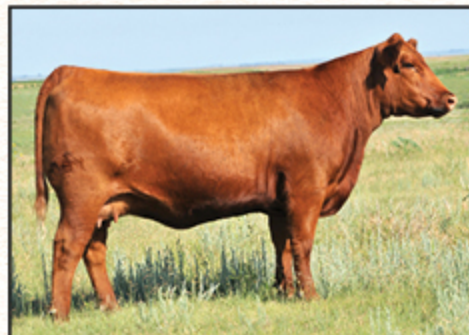
C-BAR ABIGRACE 121J