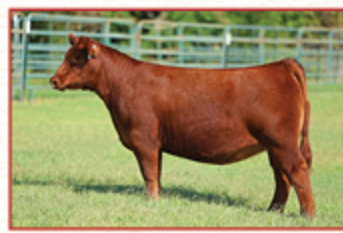
KIRWAN STONY 5007 MATERNAL SIB

Headland 363N is built for those who appreciate genuine power and presence. Ranking near the top of his contemporaries for growth, he posted an impressive 772 lb adjusted weaning weight and 1,347 lb adjusted yearling weight.