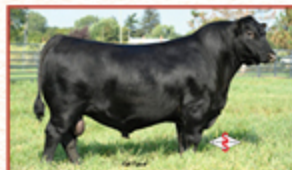
CONNEALY CRAFTSMAN SIRE