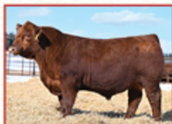
LIPTON PVF DEFIANT 329N FULL SIB