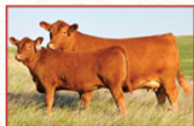
C-BAR STONY A302 DAM