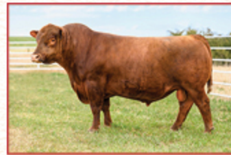
PIE INTENSITY 295 SIRE

SELLING 1/2 INTEREST AND FULL POSSESSION.