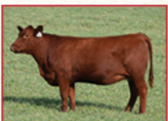
KRA PVF TILLY 4022 MATERNAL SIB