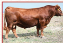
WSM PLAYMAKER 1080J MATERNAL SIB

At the buyers convenience, we are retaining the option to a flush with a minimum of (6) viable embryos to the bull of our choice.