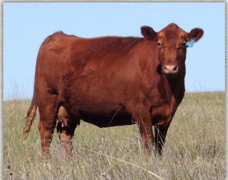
Dam to Lot 17