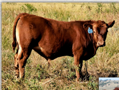
Bull calf sired by Blockade

Lots 14-20 are all closely related & sired by 5L Blockade & his sons, 5L Body Builder & Cross Block Buster. We have A.I.d to Blockade & Body Builder for several years & have been very impressed with the calves out of both sires. They are thick-butted, wide topped, deep, heavy & always excel in the herd. The females are soft made, easy fleshing and good uddered. Block Buster, a home raised ET bull out of the 15 year old Basin Duchess 6151 cow, turned out to be a very well balanced bull & his progeny are performing very well, still showing every bit of the Blockade phenotype, while adding excellent calving ease & maternal traits into the mix.