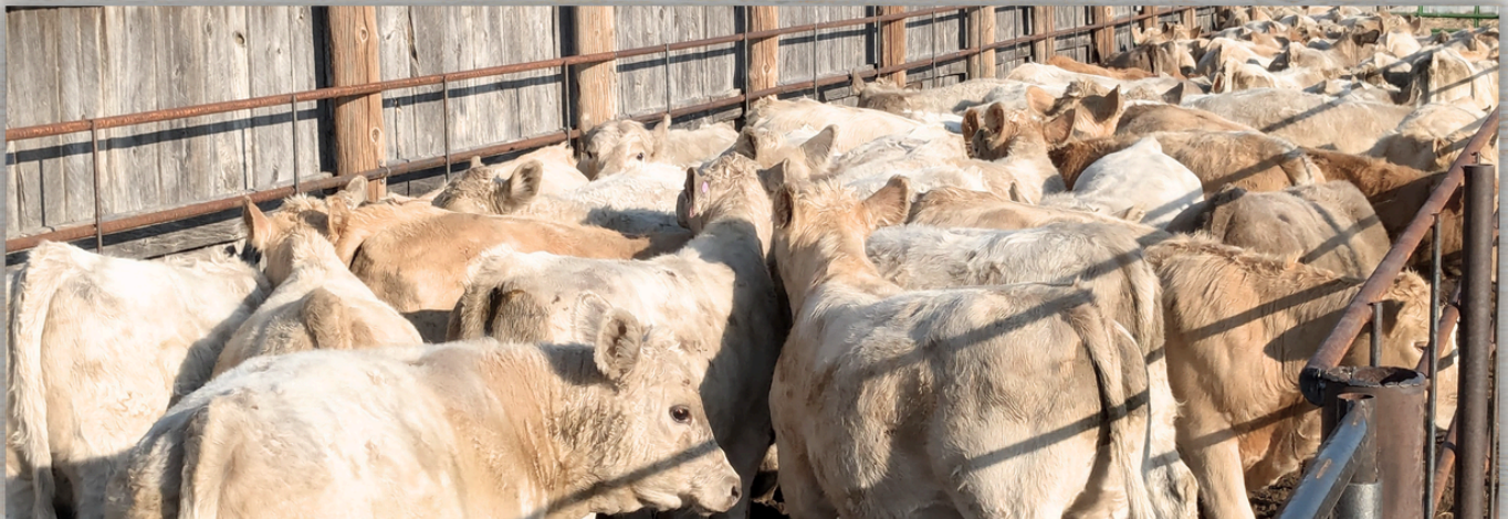
Shipping Hageman's char cross steer calves coming from the Duck Bar Ranch