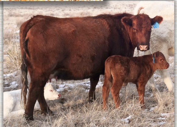
Dam to Lot 1 with her 2025 calf