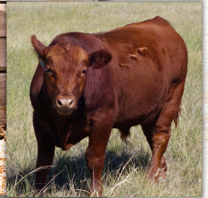
Lot 5 at 6 months old