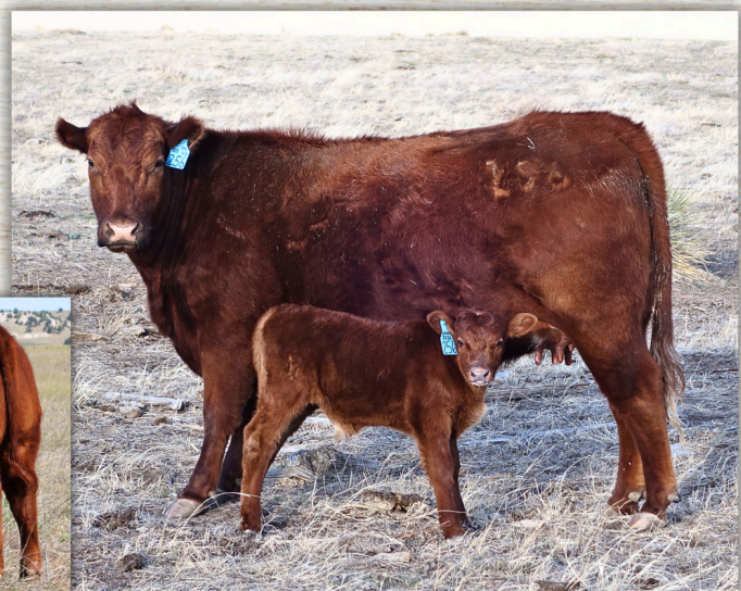
Full ET Sister to BlockBuster