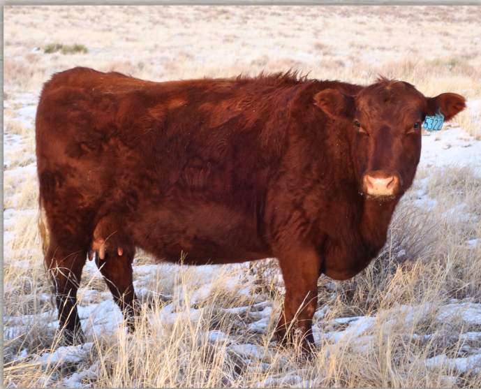
Dam to Lot 19 at age 10