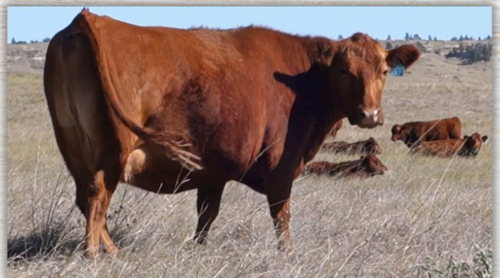
Dam to Lot 6