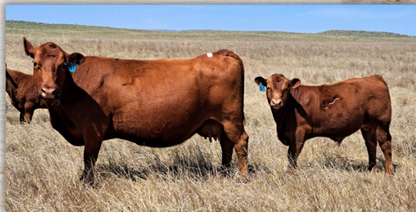
Lot 14 with his dam