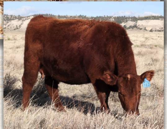
Full sister to Lot 2