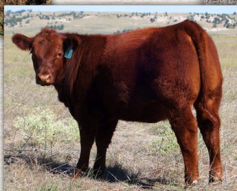
Heifer calf sired by BlockBuster