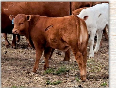
Lot 14 at 2 months old