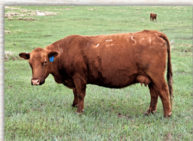
Lot 15's dam at age 8