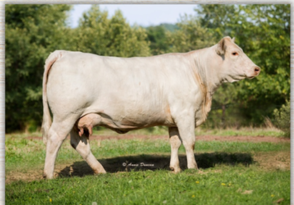
Dam to Lots 35-37