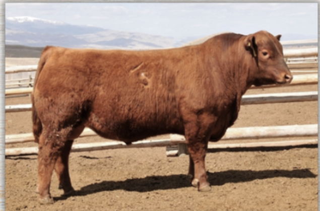
5l Blockade 2218-30B