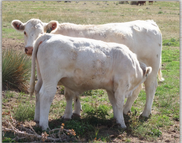
Lot 32 with his dam