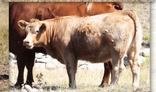
Char Cross Calves sired by Oaklee sons