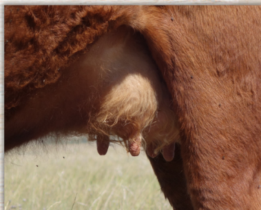
Lot 9's Dam's Udder