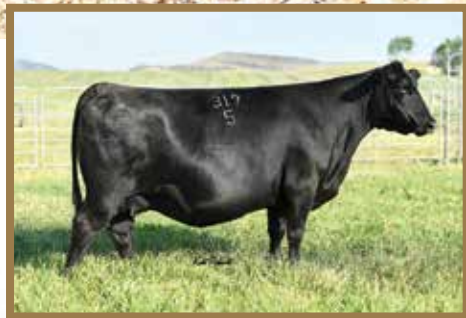
SITZ MANOR 3195, Dam