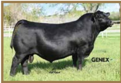
S ARCHITECT, Sire of Lots 28-34

We will kick off the two-year-old division with a set of flush brothers by the popular GENEX sire, S Architect. I have this lead bull very highly marked. I read him as being very complete in his build with extra length of spine, and plenty of muscle. He excels in terms of his EPD profile as well. From performance to carcass and management traits, this bull will add quality to any set of cows. He is a herd sire prospect for sure.