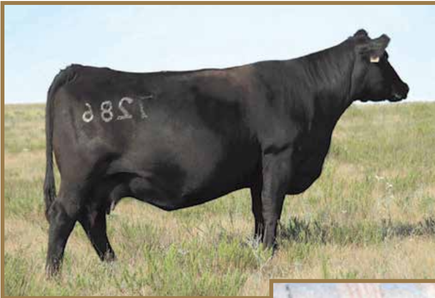
LT FOREVER LADY 7286, Maternal Granddam to Lot 12