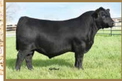
BOYD JUSTIFICATION, Sire of Lots 41-43