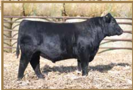
Maternal Brother to Lots 3, 4 & 5