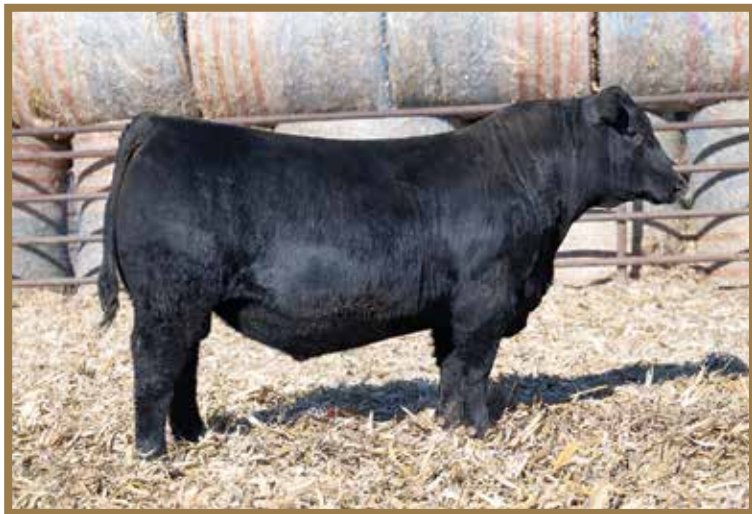
Maternal Brother to Lots 15-17

This pair of full brothers is very consistent. Both are smooth in their design, with plenty of length of spine, and depth of rib. Lot 16 is in the top 15% of the breed for both WW & YW EPDs. Lot 17 boasts a weaning weight of 750 lbs. Keep these bulls together to add uniformity to a calf crop.