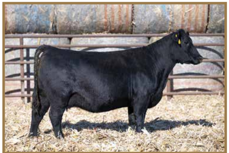
KOVARIK BLACKCAP 018, Maternal Sister to Lot 62

When I previewed the offering ahead of building the catalog, I really liked this bull. He is a maternal brother to Kovarik Blackcap 018, the dam of the lead flush of Chiefton sons. This bull has the pedigree to be a good producer.