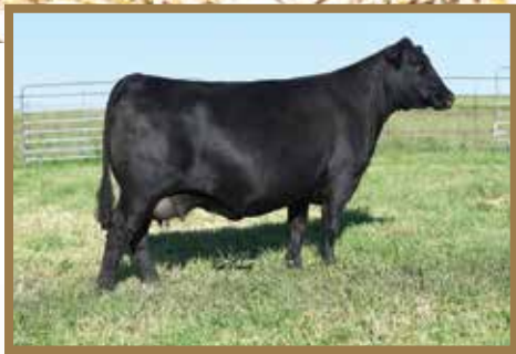
VDAR LUCY 4361, Dam of 40, 41 & 42

The next three bulls are out of the VDAR Lucy 4361 donor. Luke acquired her in 2022, mainly due to her maternal strength. While at VDAR she had a calving interval of 363 days on seven calves. This son of Koupals B&B Holy Water is exceptional. He is thick ended, big topped, and has a herd bull look from the side. Luke strives to maximize maternal traits without sacrificing performance. This bull will easily achieve those goals.