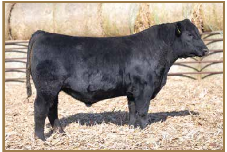
Maternal Brother to Lot 60

This is a high quality bull out of a proven cow. His dam, Miss Wix 6127 of McCumber produced bulls that sold in both the 2024 and 2025 sales. This is a high growth prospect that should add pay weight to your calf crop without sacrificing maternal value.