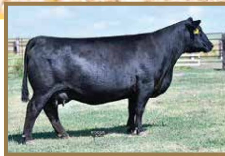
MARCYS ERICA 337, Maternal Granddam of Lot 55