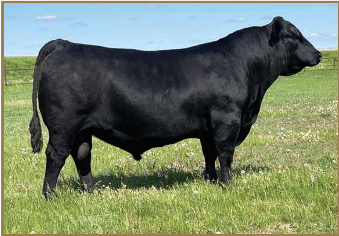
LT TALENT 3012, Sire of Lots 64-73