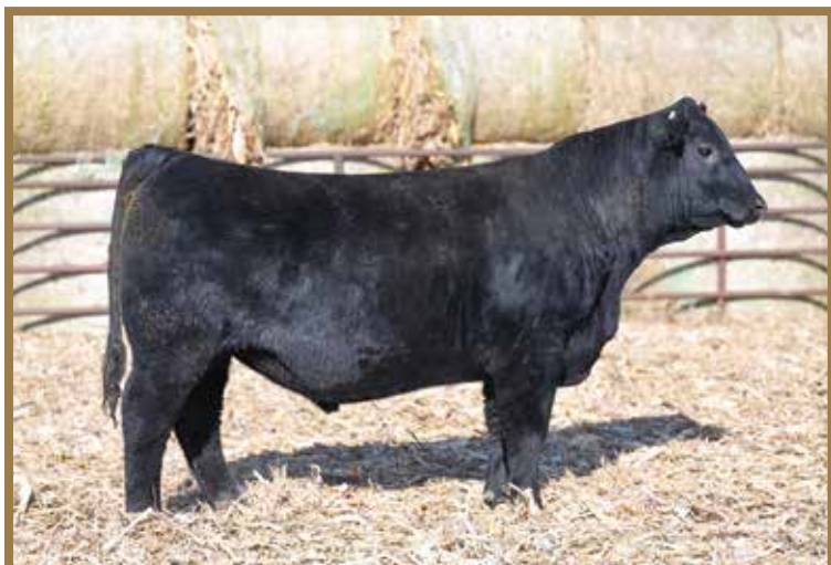
Maternal Brother to Lot 8