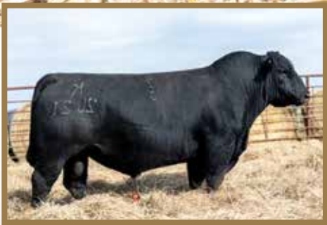
KOUPALS B&B HOLY WATER 2021, Sire