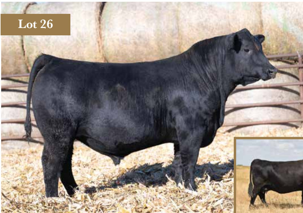
LT FOREVER LADY 5360, Dam of Lot 26