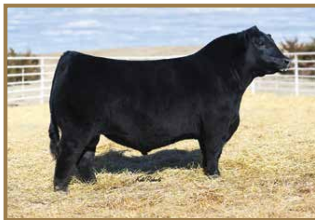
KR QUALITY 8525, Sire of Lot 26

The Boyd Justification sire group was very popular last year. This son is out of a first calf daughter of the 7286 donor. Excellent calving ease, and growth figures.