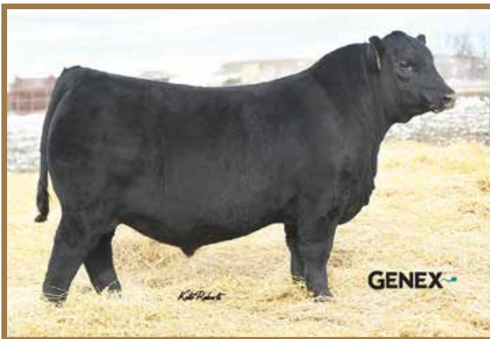
SAV ROYAL FLUSH 2735, Sire of Lots 14-19

Lot 14 KOVARIK ROYAL FLUSH 4144 BD. 08/13/24 AAA. 21334116 TATTOO. 4144