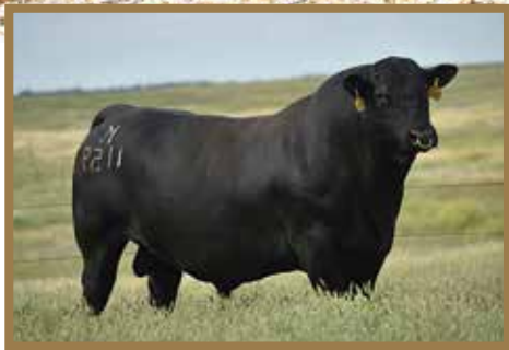
KOUPALS B&B SIGNAL 1159, Sire of Lots 20-24