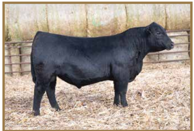
High Selling Son of Boyd Justification from 2025 Sale

This is a heifer bull out of the 0141 donor. He is a good headed bull, who is ultra-complete in his build. He does the little things correctly as well, top 20% DOC, 10% CLAW & ANGLE.