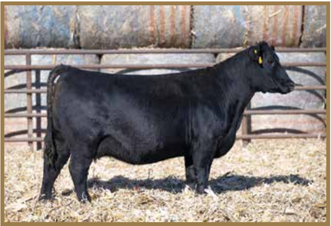
KOVARIK BLACKCAP 018 , Dam of Lots 3, 4 & 5