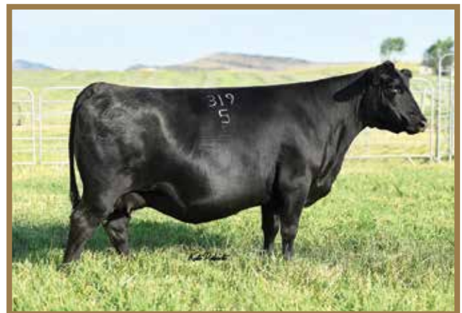
SITZ MANOR 3195, Dam of 48-54