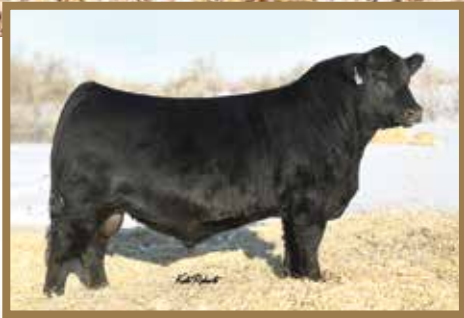
LT CHIEFTON 1440, Sire