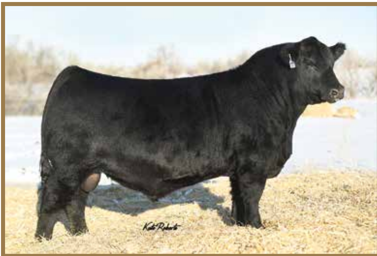
LT CHIEFTON 1440, Sire of Lots 56-62