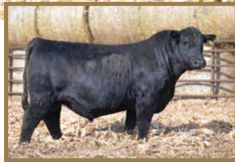
KOVARIK CHIEF 315, Full Brother to Lot 2

Kovarik Crown 4146 is a bull we wanted to feature in this year's sale. He is an exceptional son of Chiefton out of the Sitz Manor 3195 donor. A full brother to this bull, Kovarik Chief 315, was selected as the high seller in the 2025 sale by Raven Angus, Colome, SD. Lot 2 offers breed leading growth and management traits, alongside an impressive phenotypic presence. Note this bulls top 15% HP and 5% $M.