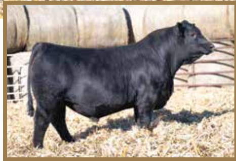
LOT 1, Maternal Brother

This is one of my highest marked two-year-olds in the offering. He is a maternal brother to the Lot 1 bull earlier in the book. This Chiefton son is very good. He offers plenty of calving ease, alongside the performance attributed to the Chiefton sire group. This is a heifer bull prospect that has eye appeal and is good on his feet and legs.