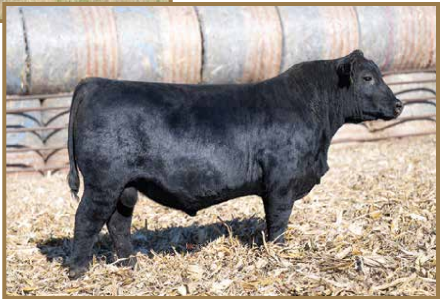
Maternal Brother to Lot 12