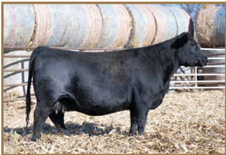
IRON MTN EMBLYNETTE C107, Dam of Lot 7

Lot 6 is marked well in my book. He is ultra-complete in his build with plenty of body depth, and overall performance. Note this bulls advanced growth and management traits, along with his top 10% $W. His SAV Resource bred dam is one of our favorite cows in the herd.