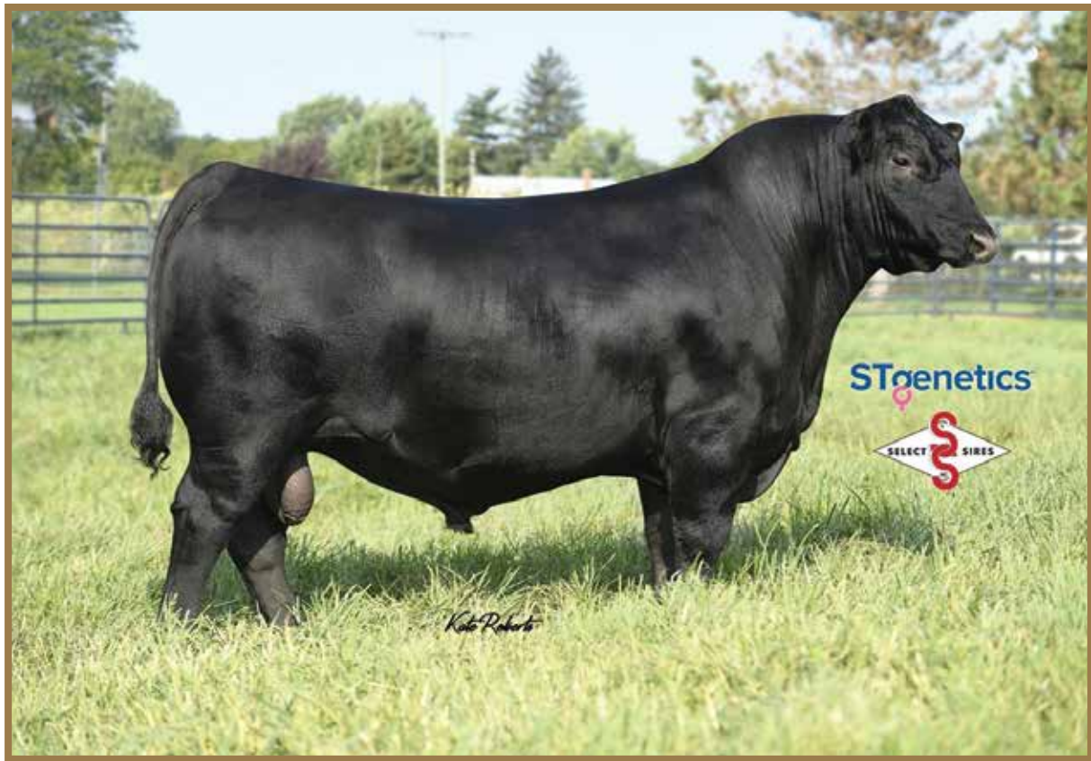
CONNELY CRAFTSMAN, Sire of 48-54