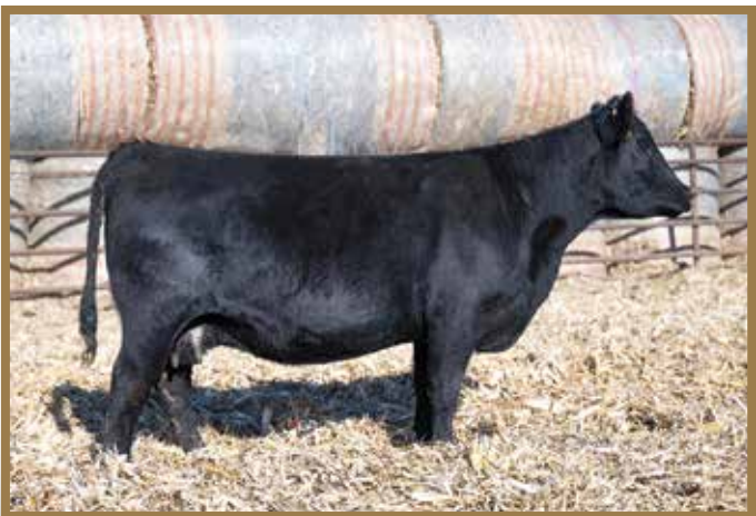
KOVARIK BLACKCAP BESSIE 838 , Dam of Lots 15, 16 & 17

Lot 15 a Royal Flush son out of the cornerstone donor Kovarik Blackcap Bessie 838. This cow has been one of the best producing females in the program. In the 2024 sale, three sons averaged $12,500. Last year Freouf Angus added a son of hers to use within their purebred herd. This bull is very complete in his build, with plenty of eye appeal, and performance with almost 800 lbs. of weaning growth.