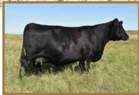
LT BLACKCAP BESSIE 0141, Dam of Lots 20 & 21