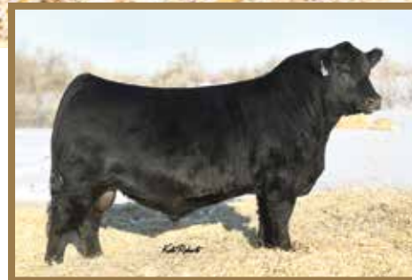
LT CHIEFTON 1440, Sire