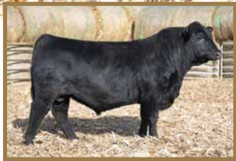
Maternal Brother to the Dam of Lot 1