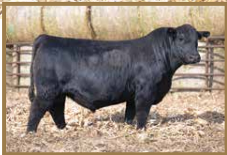
KOVARIK CHIEF 315, Full Brother to Lot 35