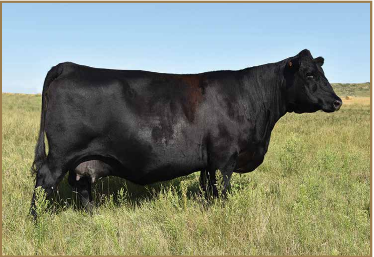
LT BLACKCAP BESSIE 0141, Dam of Lots 37, 38 & 39