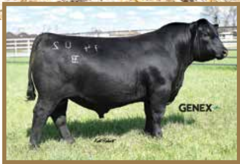
E&B WILDCAT, Sire