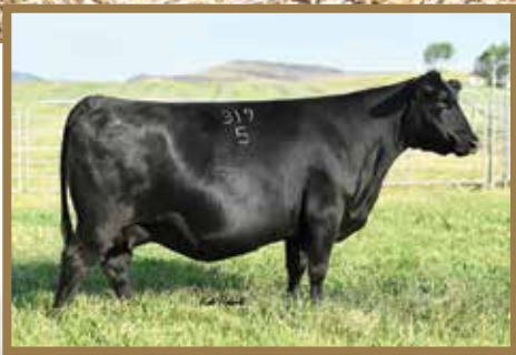
SITZ MANOR 3195, Dam