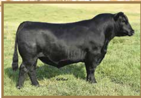
BALDRIDGE FLAGSTONE F411, Grandsire of Lot 55