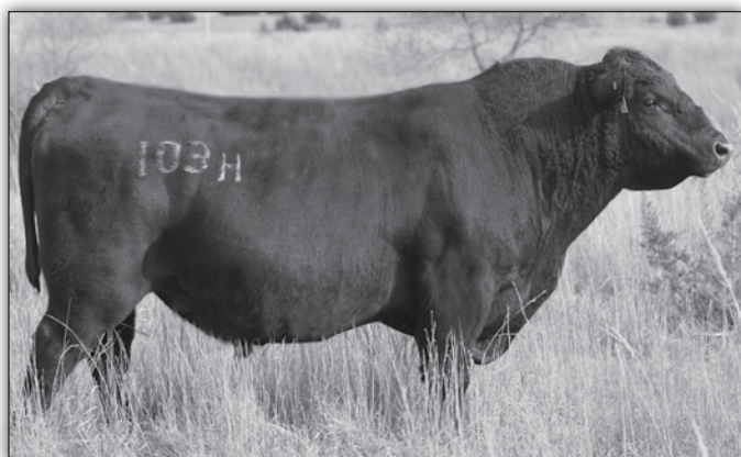
Ferguson Breakout 103H (Ref K)