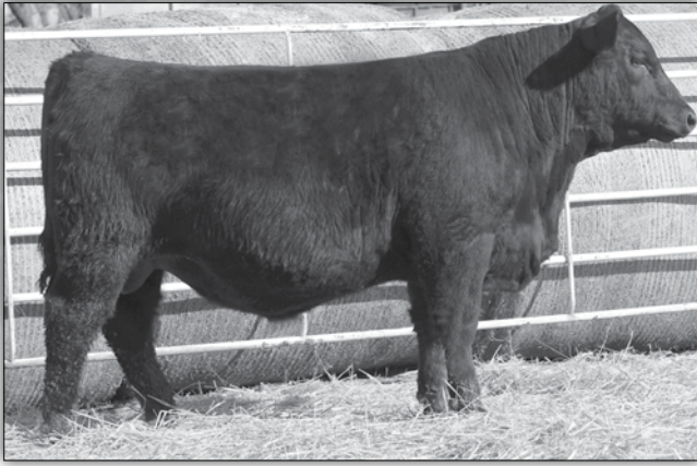
Molitor Man in Black 896-264 (Lot 13)