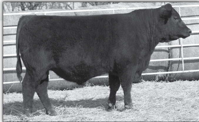
Molitor 013 Windy 1003-884 (Lot 86)

A predictable bull to have Calving Ease and Lighter Birth Weights in his progeny. His Milk, Scrotal, HP and Docility have strong values and his Marbling EPD is 4th highest among the sale bulls.