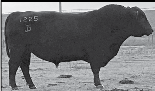
D A R Plus One 1225 (Ref R) For Reference Only