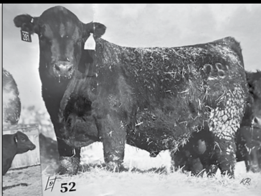
Deppe WW SFF Incredible 281 (Ref 0) - For Reference Only