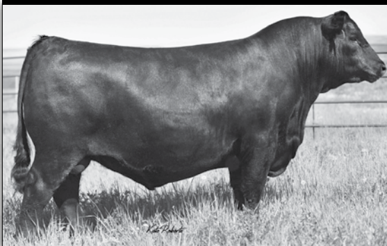
LAR Man In Black (Ref B) - For Reference Only