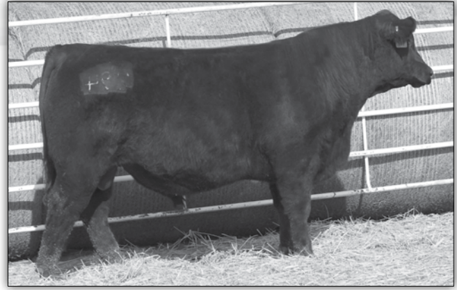
Molitor 0181 Dually 917-294 (Lot 63)