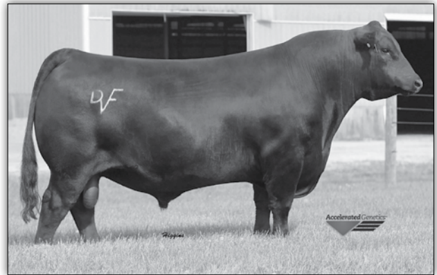
Deer Valley Wall Street - Sire of Reference Sire S

Bourbon Street was bred in the Stewart Angus herd in Indiana and had the high MBT Index of 122 and ADG Ratio of 143 to lead off the 2021 Midland Bull Test Sale against 500 contemporaries that sold after him. His sire is the famous full brother to "Growth Fund" with his grandam, Jet SS A99, being a maternal sister to SS Niagara Z29. His dam, Jet SS C58, has a phenomenal record of WR 117 on 7 calves and YR 116 on 5 calves. "Bourbon Street" Ranks in the Top 25% of the breed for CED, WW, YW, HP, Milk, CW, $Wean and $Feedlot. Co-owned with Stewart Angus.