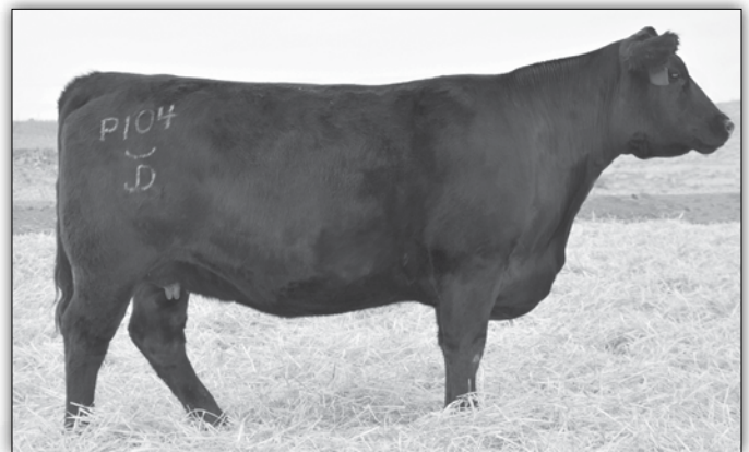
D A R Maxine P104 - Dam of D A R Alpine 0158 (Ref Q)

A high Docility EPD female that Ranks number one for both Claw and $EN EPD among the sale group. The dam traces to a cow family noted for great longevity and many years of high production.