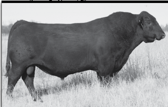
Windy Ridge Great Plains 013 (Ref P) - For Reference Only