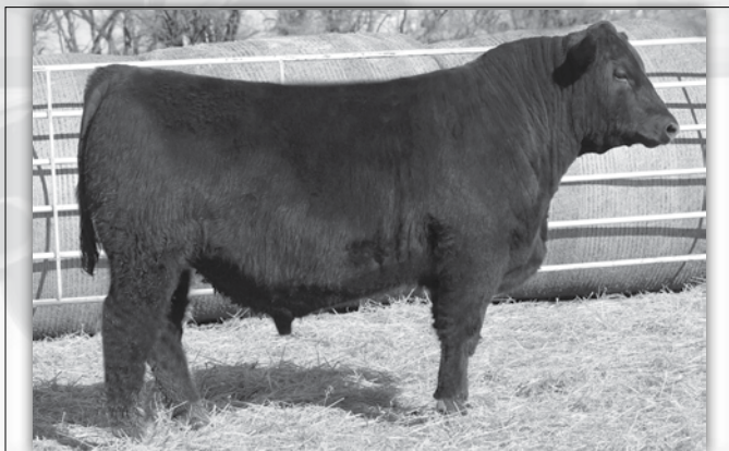
Molitor 257J Growth 905-674 (Lot 65)