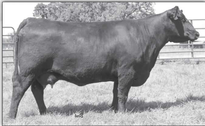
Mead Primrose N198 - Dam of Mead Magnitude (Ref I)