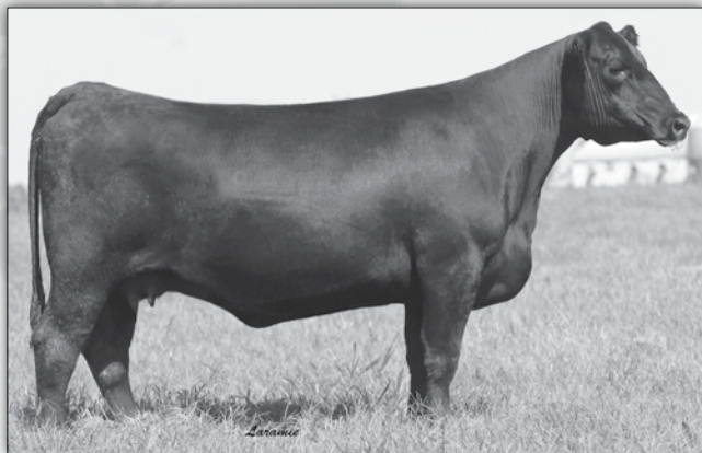
Jet S S A99 - Grandam of S S Bourbon Street H111 also a maternal sister to S S Niagara Z29