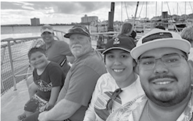
Oak Family on vacation