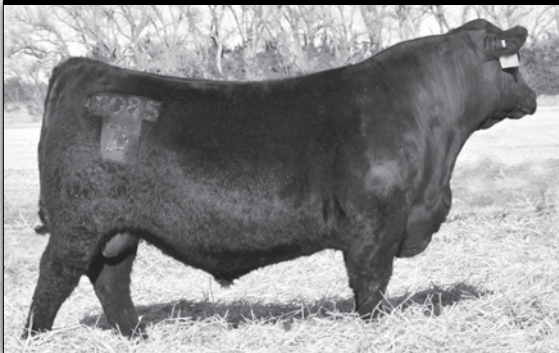
D A R Propel T085 (Ref D) - For Reference Only