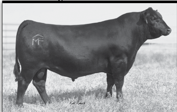
Mead Magnitude (Ref I) - For Reference Only