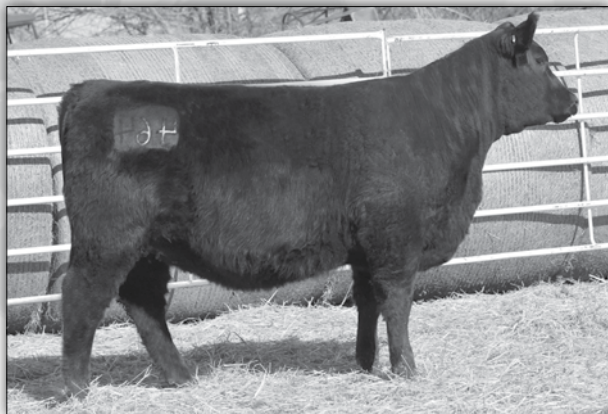
Molitor 170 Mignonne 188-464 (Lot 125)