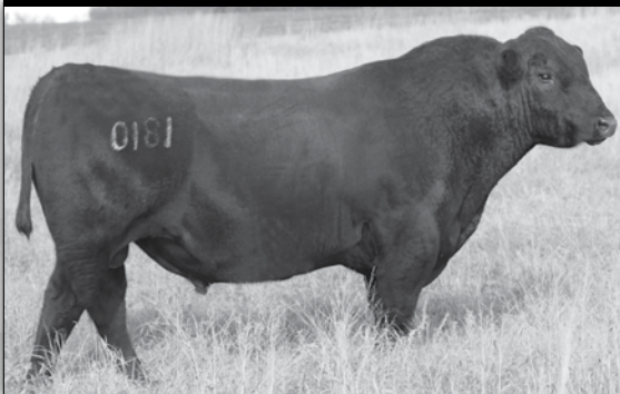
LD Dually 0181 (Ref L) - For Reference Only