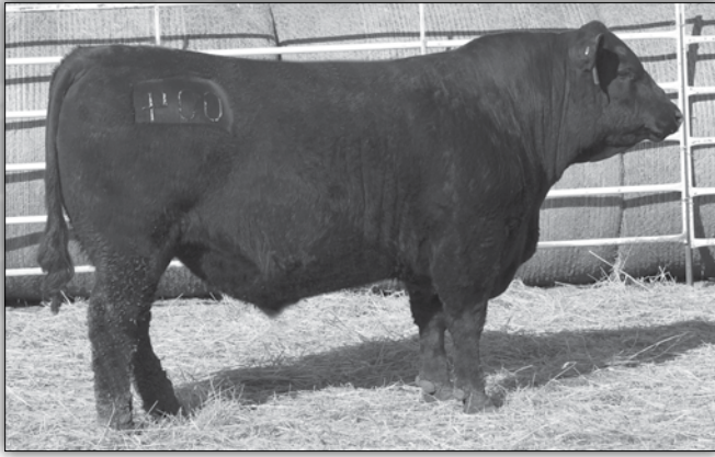
Molitor Propel 210-004 (Lot 22)