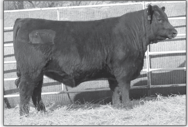
Molitor Man in Black 046-274 (Lot 15)