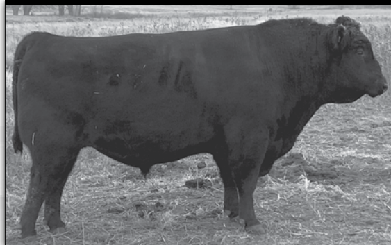
Ferguson Growth Fund 257J-B (Ref M) - For Reference Only