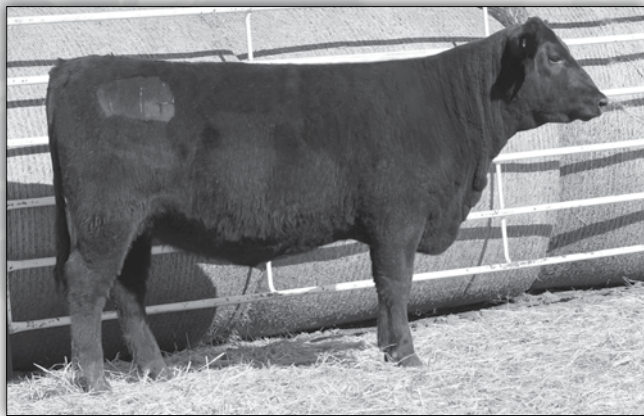
Molitor Mead Mignonne877-417 (Lot 102)