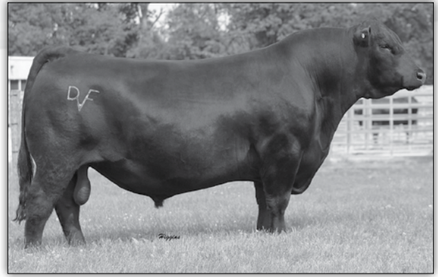
Deer Valley Growth Fund - Sire of Reference Sires M and N

Dually 0181 is a full brother to LD Essential 8021 who resides at the Origin stud in Montana. His dam is LD Capitalist 316's only full sister. He came to Molitor Angus as the Lot1 and the high selling bull in 2022 at Luddington Angus sale near Freedom, OK. He has impressive EPDs for WW, YW, CEM, CW and $Feedlot that Rank in the Top 10% of the breed. His dam has 24 Genomic Progeny on record with 7 daughters in production. Co-owned with Luddington Angus.