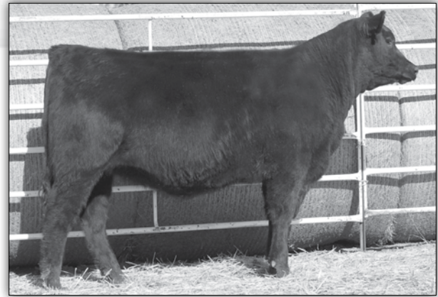
Molitor 1225 Blkcap 148-455 (Lot 123)

A female that Ranks in the Top 25% of the breed for WW, YW, and $Grid. Her $Grid is the best in the Sale heifer offering and she is also 5th highest for Marbling EPD.