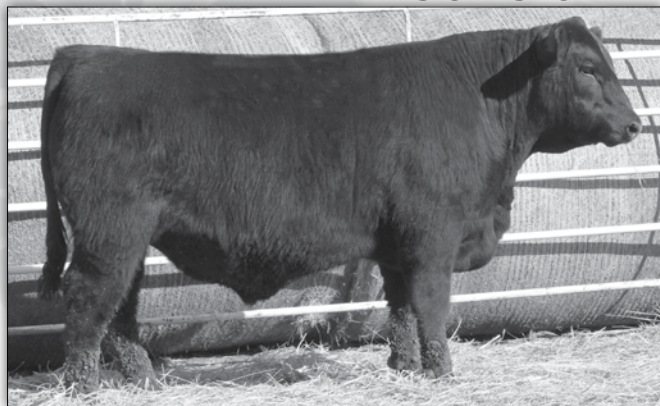
Molitor Dynamic 055-584 (Lot 1)