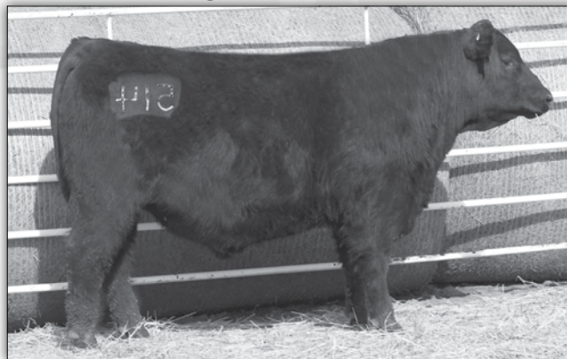
Molitor Dynamic 253-514 (Lot 3)