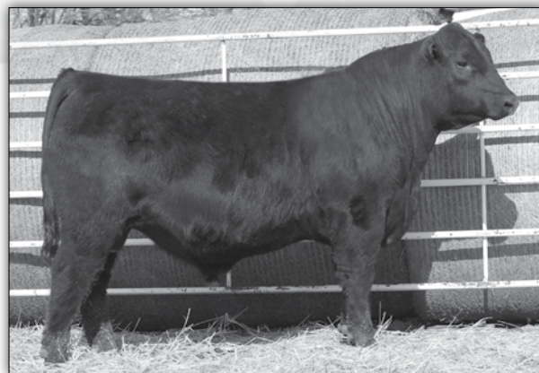
Molitor Safe&Sound 063-164 (Lot 20)

This bull has the Top Weaning Weight among the Safe and Sound sons with a 2-year-old dam by Mead Magnitude. He Ranks in the Top 10 among the sale bulls for CED, $Wean, and $Grid.