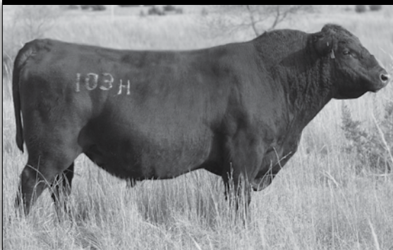
Ferguson Breakout 103H (Ref K) - For Reference Only