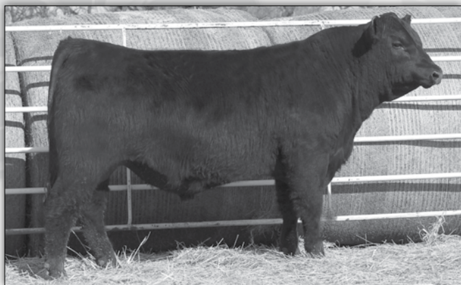
Molitor Bankroll 245-954 (Lot 30)