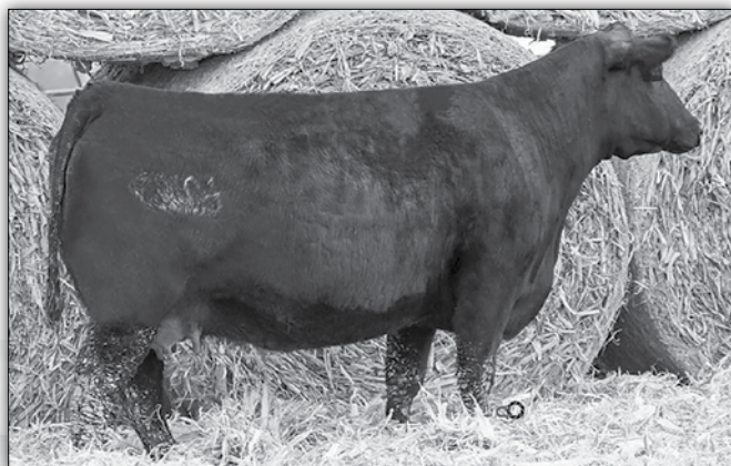
Werner Lady Jaye 6222 - Dam of both Deppe WW SFF Growth Fund 170 (Ref N) and Deppe WW SFF Incredible 281 (Ref O)

Notice the CED and BW on this bull that Ranks in the Top 15% of the breed comparing 160,000 animals in that Angus database of non-parent bulls. 7th best bull in the sale for Angle EPD.