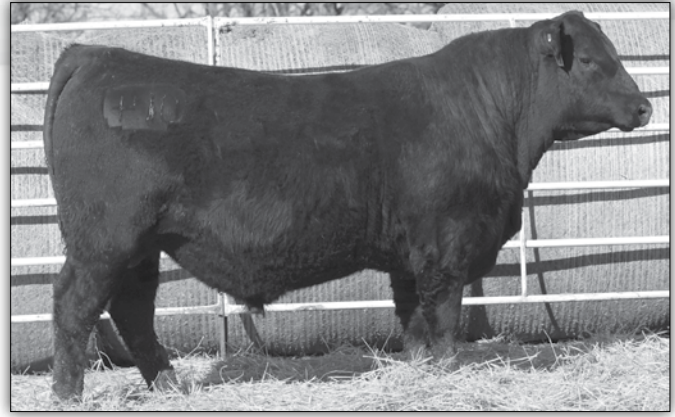
Molitor Propel 975-014 (Lot 24)