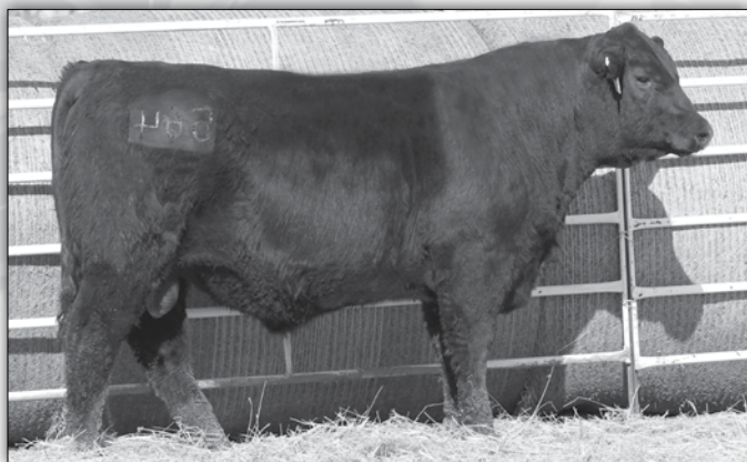
Molitor 170 Growth 935-564 (Lot 70)