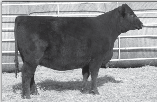
Molitor H111 Lana 018-492 (Lot 134)