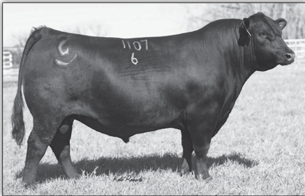
Sitz Alpine 11076 - Sire of Reference Sire Q

Alpine 0158 is a very impressive sleep at night Calving Ease bull in the Top 2% of the breed for CED and CEM EPDs. He is Top 15% or better for BW, YW, Marbling and Heifer Pregnancy (HP). His donor dam has 55 Genomic progeny on record including 18 daughters in production with a WR 101 on their calves. "Alpine 0158" first daughters in production have a WR 102 on their calves. Co-owned with Dix Angus Ranch.