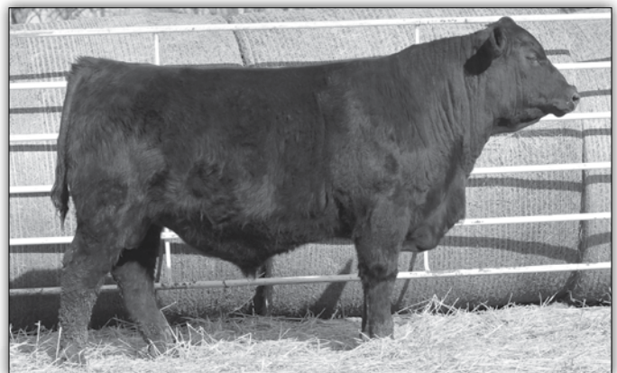
Molitor Bourbon St 170-1194 (Lot 101)

The number one bull in the sale for $Maternal and Claw EPDs. Ranks 8th for Docility, Angle, and Milk EPDs. Impressive EPDs for Docility, Foot Quality, HP, Milk, and $Maternal at +100 (Top 1%).