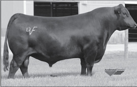
Deer Valley Wall Street - Sire of S S Bourbon Street H111 (Ref S) For Reference Only

BD: 01-04-2020 #*Basin Payweight 1682 +*Deer Valley Wall Street 18827829 +*Deer Valley Rita 36113