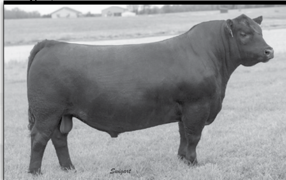
Bigk/WSC Iron Horse 025F (Ref J) - For Reference Only