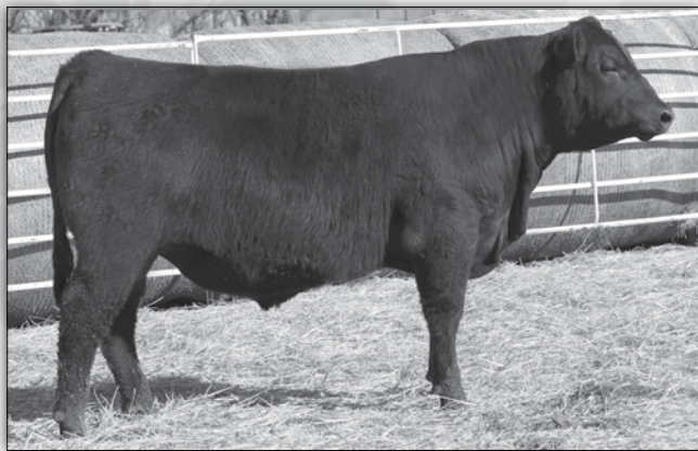
Molitor Magnitude 224-084 (Lot 34)