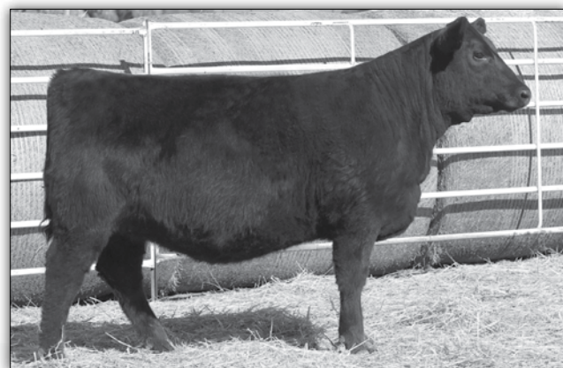
Molitor DynamicBlkbrd077-447 (Lot 112)

• A female with strong traits for Calving Ease, Docility, and Carcass Merit. She Ranks among the Top 6 in the Sale for Docility, Marbling, and $Grid. Top 25% in the breed for CED, BW, Docility, and $Wean.