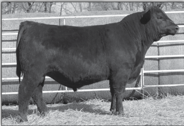
Molitor Breakout 182-824 (Lot 56)