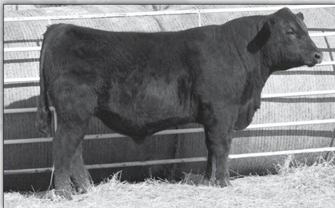
Molitor Ironhorse 0110-144 (Lot 39)