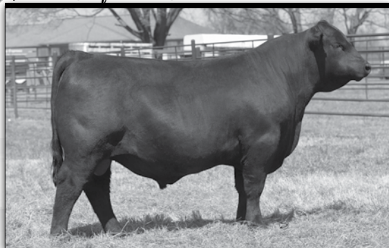
HF Safe & Sound 019 (Ref C) - For Reference Only