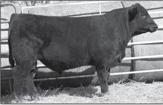
Molitor 0181 Dually 949-304 (Lot 61)