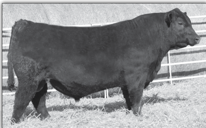
Molitor Propel 978-002 (Ref E)

This female will be a Foot Quality improver and Ranks 5th among the sale group for Claw, Angle and Ribeye. In the breed, she is Top 25% or better for CED, WW, YW, Docility, Claw and Angle. She has hard to find Calving Ease and High Growth genetics.