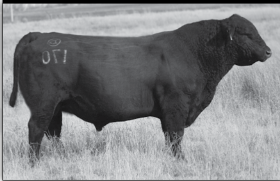
Deppe WW SFF Growth Fund 170 (Ref N) - For Reference Only

BD: 02-23-2021 #*Basin Payweight 1682 #*Deer Valley Growth Fund 18827828 *Deer Valley Rita 36113