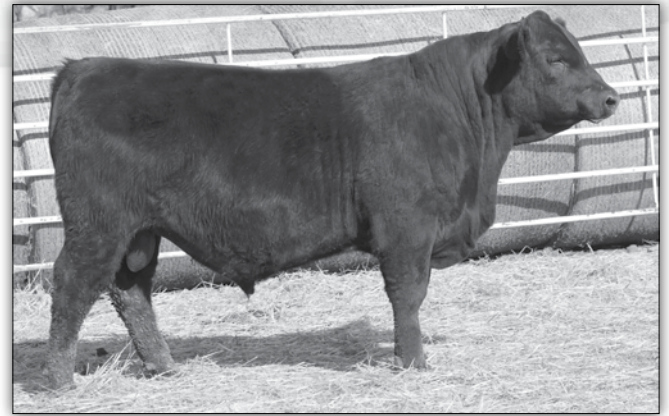
Molitor Breakout 198-764 (Lot 54)

This bull Ranks high for use on heifers with a CED, BW, and CEM that is in the Top 1% of the breed. Among the sale bulls, he is Top 4 for CED, BW, HP, and CEM.