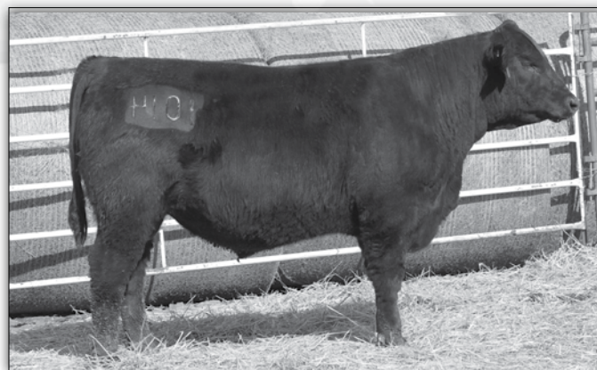
Molitor Incredible 209-1014 (Lot 81)

• His Docility and growth performance EPDs Rank in the Top 10% of the breed. Among the sale bulls, he Ranks 7th for $Wean which is Top 4% among non-parent Angus bulls.