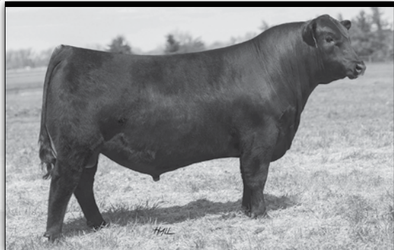
Barstow Bankroll B73 (Ref H) - For Reference Only

BD: 02-14-2014 Bull #*18036327 Tattoo: B73 #*Sitz Dash 10277 #*Sitz Upward 307R #*Barstow Cash +Sitz Everelda Entense 2665 17145326 Barstow Queen W16 #*S A V Final Answer 0035 RCA Queen R42 #CAR Efficient 534 K C F Bennett Efficient Barstow Miss Dianna Z25 #CAR Miss Susie 308 17479418 #Barstow Miss Dianna X128 #*SydGen C C & 7 Barstow Miss Dianna BA T134