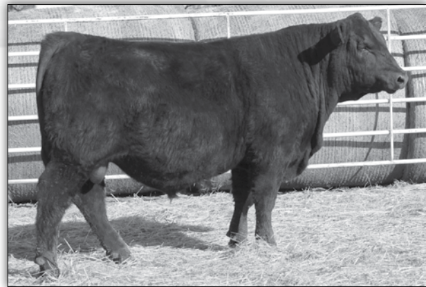
Molitor Breakout 991-844 (Lot 48)

• He puts together a couple of the most important values that are needed in the cattle business with a CED and YW that Rank in the Top 15% of the breed. ADG Ratio of 106.