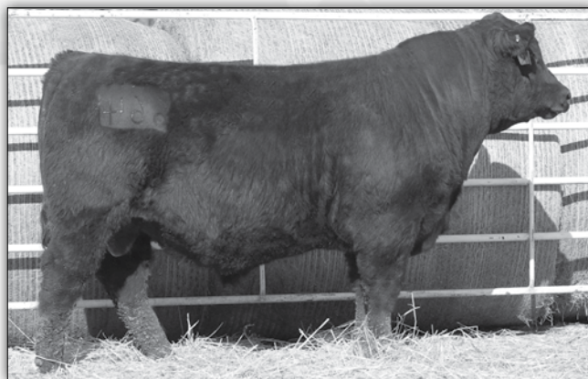
Molitor 170 Growth 912-664 (Lot 72)