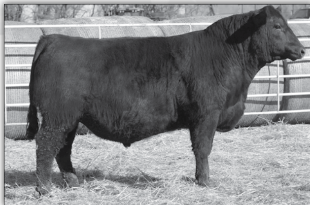
Molitor Bankroll 9004-974 (Lot 32)