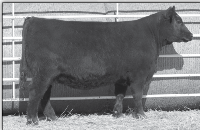
Molitor Dynamic Barba288-439 (Lot 111)

Again this year, we are offering a quality group of open females. Our selection process is to sell replacement heifers that represent the sire groups in our calf crop. These females sell with HD50K DNA Tests and are in good healthy breeding condition. OCV, OPEN and Ultrasound.