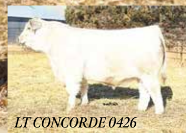
LT CONCORDE 0426