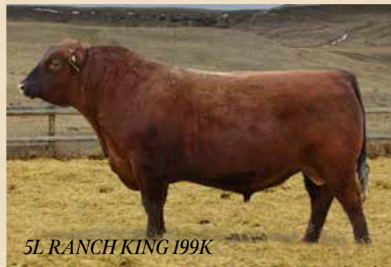
5L RANCH KING 199K