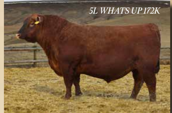
5L WHATS UP 172K

Lot 154... 119 ADG, 129 IMF & 114 REA ratios